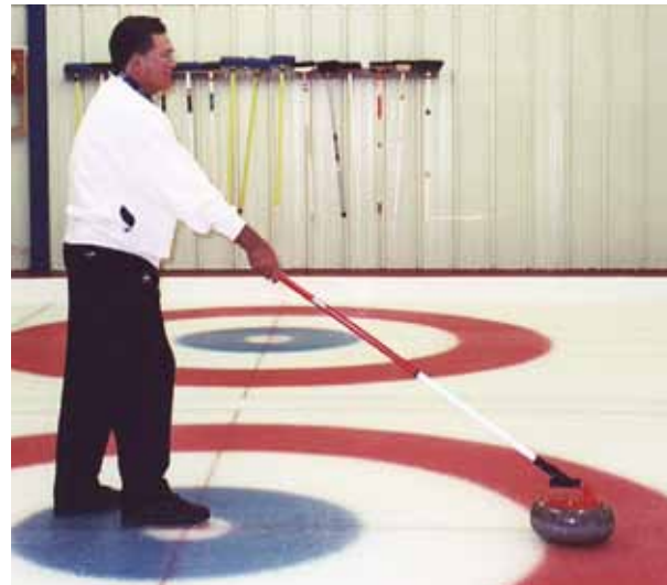
"Stick Curling" allows seniors and those with physical limitations to remain active and "Keep on Curling"