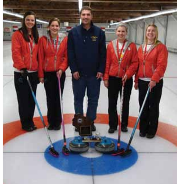
The Wausau Curling facility is host to the largest high school curling program in the USA!

In addition, three local Wausau-area high schools — East, Everest and West — operate very successful girls' and boys' interscholastic programs at the curling facility. Total high school participation is in excess of 150 young adults — the largest such program in the United States. Precise economic demographics on club membership are not available. The economic spectrum of club members, however, broadly matches that of the local area.