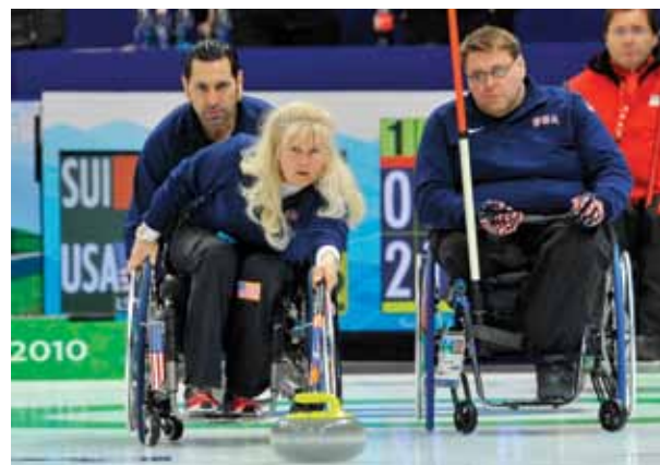
Curling is fully adaptable for those in wheelchairs and with other physical limitations. This new facility will provide full accessibility and will be the best wheelchair curling facility in the USA.